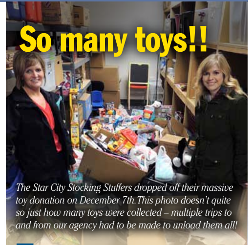
The Star City Stocking Stuffers dropped off their massive toy donation on December 7th. This photo doesn't quite show just how many toys were collected – multiple trips to and from our agency had to be made to unload them all!

Thanks to the Star City Stocking Stuffers – customers and employees of several local credit unions including LincOne Federal Credit Union, University of Nebraska Federal Credit Union, MembersOwn Credit Union, Nebraska State Employees Credit Union, and Liberty First Credit Union – and many Kampout for Kids contributors, Community Action has been able to stock our store with toys for participants to choose from for their kids for the holidays. Instead of using money, Community Action participants use points they have earned in our programs for achieving self-sufficiency goals. Many participants wait all year to use their points to get holiday gifts for their children. This would not be possible without the generous support of our community! Thank you!