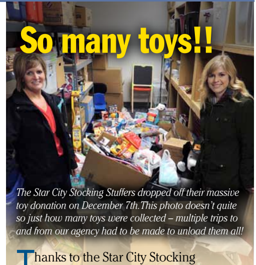
The Star City Stocking Stuffers dropped off their massive toy donation on December 7th. This photo doesn't quite show just how many toys were collected – multiple trips to and from our agency had to be made to unload them all!

Thanks to the Star City Stocking Stuffers – customers and employees of several local credit unions including LincOne Federal Credit Union, University of Nebraska Federal Credit Union, MembersOwn Credit Union, Nebraska State Employees Credit Union, and Liberty First Credit Union – and many Kampout for Kids contributors, Community Action has been able to stock our store with toys for participants to choose from for their kids for the holidays. Instead of using money, Community Action participants use points they have earned in our programs for achieving self-sufficiency goals. Many participants wait all year to use their points to get holiday gifts for their children. This would not be possible without the generous support of our community! Thank you!